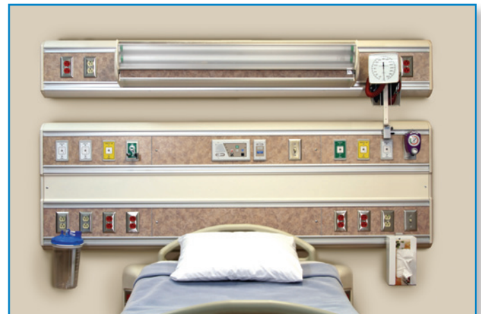
Figure 1. Majestic Series Double Tier Headwall System

The Amico Majestic Series Double Tier Headwall shall be manufactured by Amico Corporation, in accordance with job specific shop drawings and documents. The complete Headwall assembly shall be cULus listed. The following is a general specification, and components listed may not be present or required in final product.