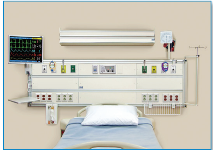
Figure 1. Majestic Series Recessed Double Tier Head-wall System

The Amico Majestic Series Recessed Double Tier Head-wall shall be manufactured by Amico Corporation, in accordance with job specific shop drawings and documents. The complete Headwall assembly shall be cULus listed. The following is a general specification, and components listed may not be present or required in final product.